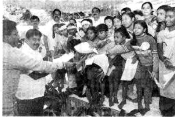
Students interacting with the corporators during the Ward Sabha on Thursday