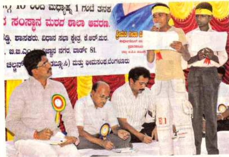
TAKING CENTRE STAGE: Children from different schools in Vigyan Nagar ward taking part in the 'Children's Ward Sabha' in Bangalore on Thursday.